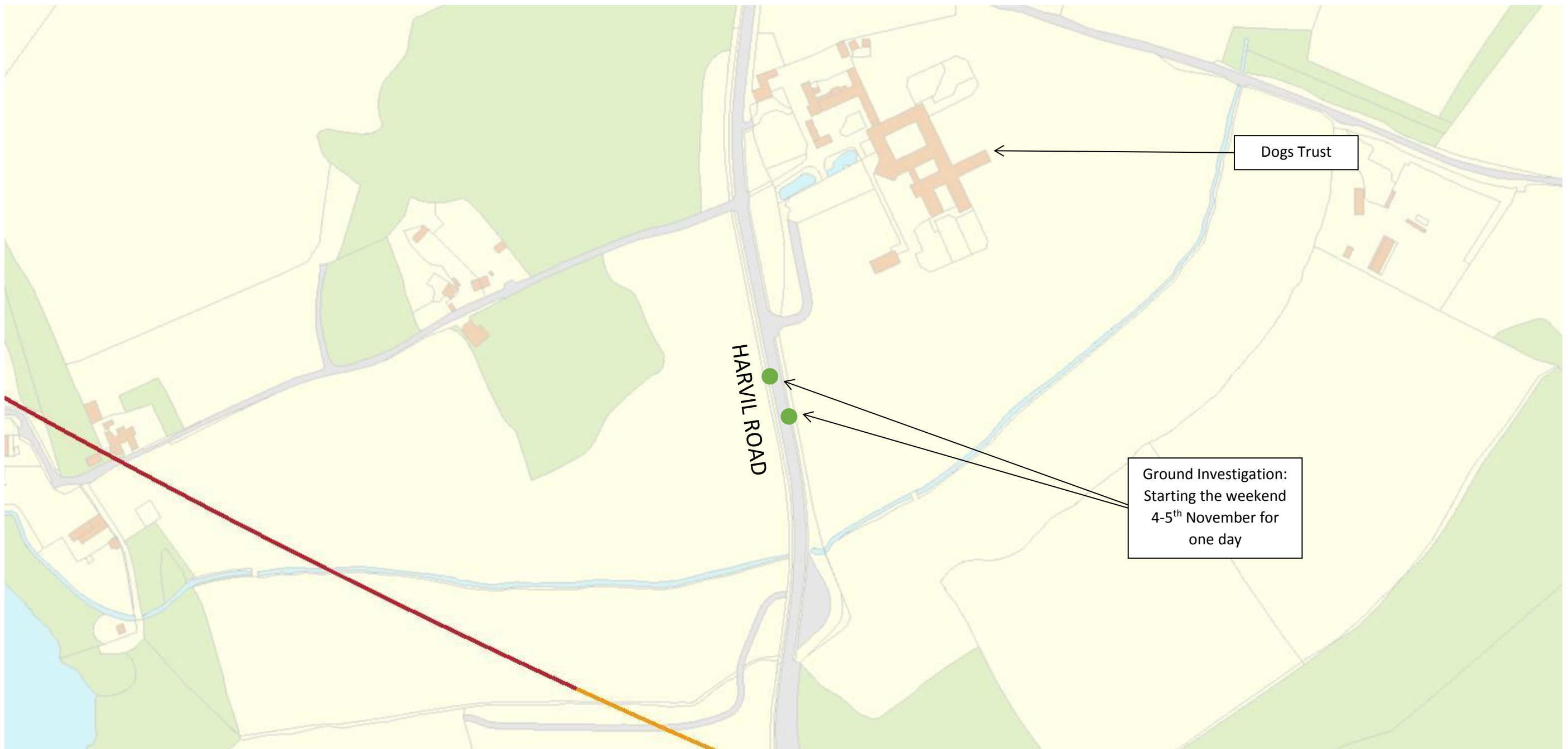
The map above shows a rough estimation where the pavement cores will be